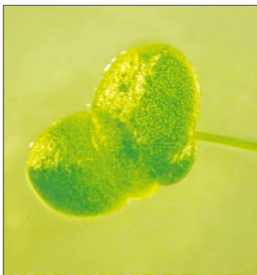
Enlargement of the aquatic plant Lemna used in Biolex' LEX SystemT for the production of recombinant therapeutic proteins.

astrously since they place the entire batch at risk.