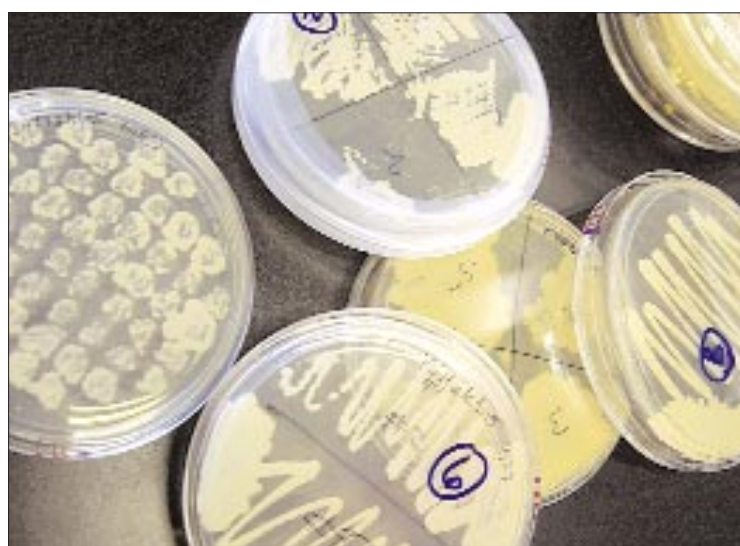
GlycoFi says its engineered yeast variants offer rapid cycle times from gene to protein.